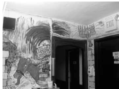
New mural in Religious School

While the students were away on their summer vacations, the hallways of our school were very quiet and lonely. We can't wait to hear the hustle and bustle of the children, their laughter in the hallways and their voices in the sanctuary. While the students were away, we missed them, and we are thrilled to have them back!